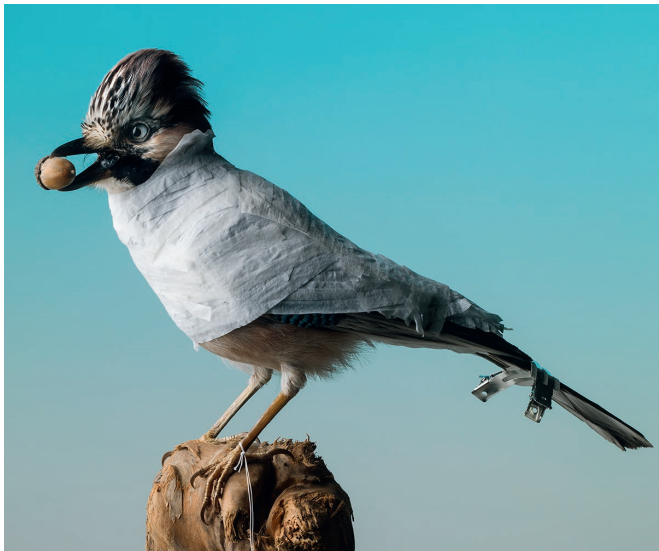
Eurasian jay getting a "spa treatment" before the exhibition opening

Today, our region is composed of the Jura and the Plateau. During millions of years, it was covered by an impressive sea. Its appearance was marked mainly by the emergence of the Alps and the advance of the glaciers in the quaternary period. Fossils of exotic animals and plants bear witness to these early chapters of the history of nature. We examine today's diversity of living beings according to their different diets. We show the "big feast" or in other words, what it means to be a plant, a herbivore, or a predator.