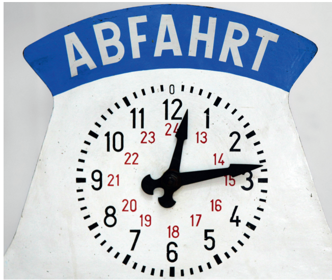
Missed your train? It is never too late for a stopover in Olten (former departure time clock at Olten train station).

Olten is known to everybody in Switzerland. Tens of thousands of railway passengers travel through the transport intersection and local train station on their journeys from east to west or from north to south every day. Some get off the train here, but most continue on. Those who do get off, change trains and leave again soon afterwards. The new permanent exhibition of the Historical Museum now provides a reason to stop and discover the eventful and fascinating history of the city on the intersection of many routes. Interactive points as well as audio and video records ensure that you have a multi-sensory experience. A "history workshop" will entice you to take a look at the work that goes on behind the scenes.