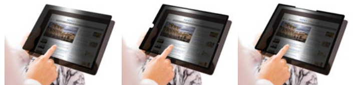
Gearlab® Adhesive Privacy Filters for frameless displays.