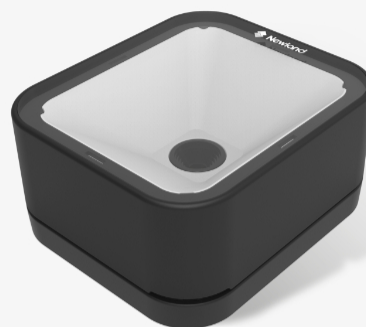
FR27 Urchin stationary scanners