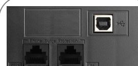
USB port, RJ-11, RJ-45 surge Protection