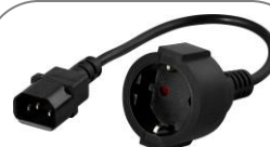
Optional Accessory: IEC -> Schuko Converter Item Nr.: 91015003