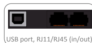
USB port, RJ11/RJ45 (in/out)